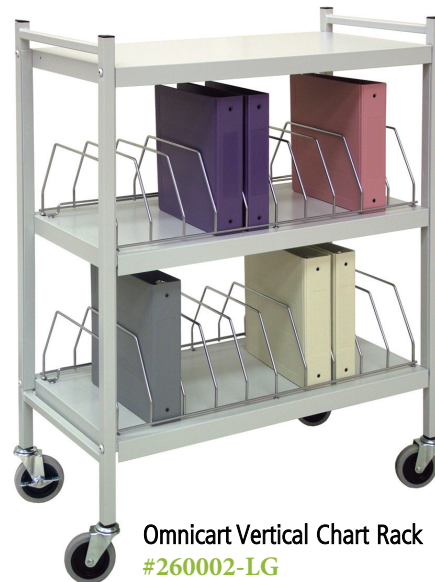
Omniscart Vertical Chart Rack #260002-LG