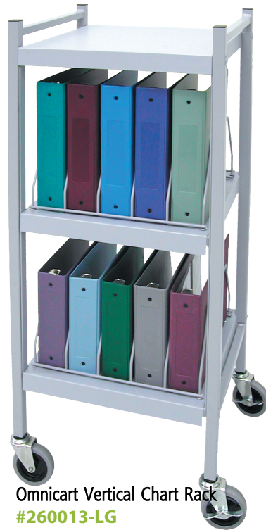
Omniscart Vertical Chart Rack #260013-LG