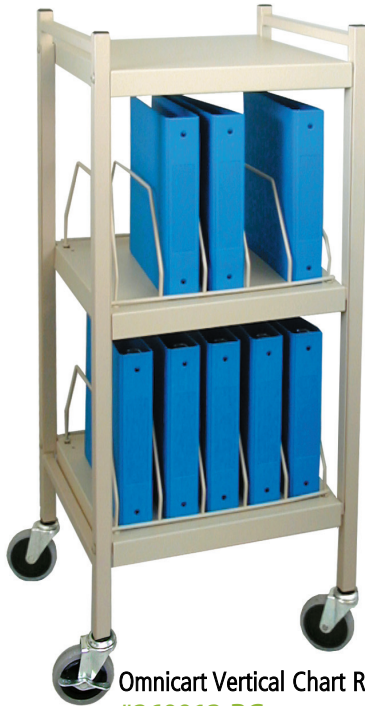
Omniscart Vertical Chart Rack #260013-BG

Improve business efficiency • Improve employee workplace safety • Improve patient care & management