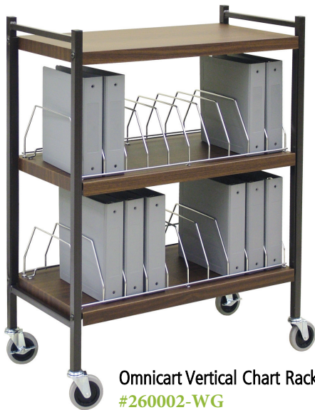
Omniscart Vertical Chart Rack #260002-WG